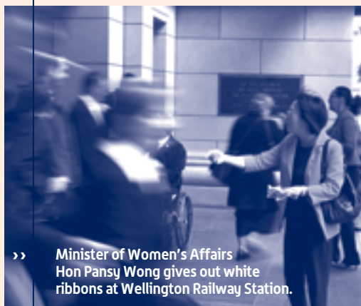
» Minister of Women's Affairs Hon Pansy Wong gives out white ribbons at Wellington Railway Station.

» Over half a million white ribbons were distributed for this year's International Day for the Elimination of Violence against Women – White Ribbon Day – which is held every year on 25 November.