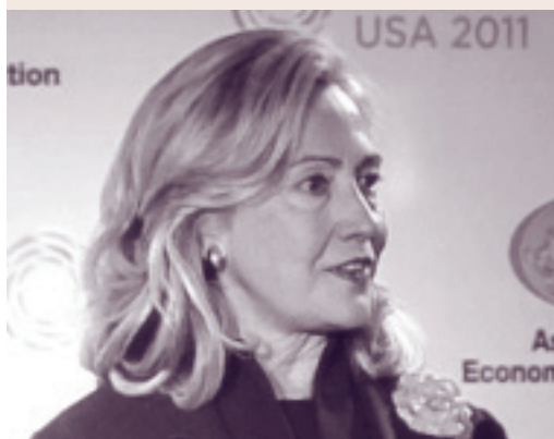
U.S. Secretary of State Hillary Clinton delivered a keynote address during the APEC Women and the Economy Summit, San Francisco, California, USA.

A Goldman Sachs report shows how a reduction in barriers to female labour force participation would increase USA's GDP by 9 percent, the Eurozone's region's by 13 percent, Japan's by 16 percent and New Zealand's by 10 percent.