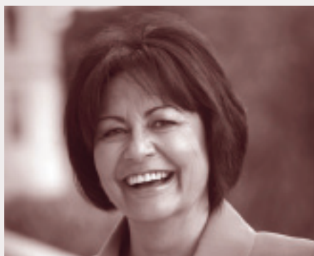
Hon Hekia Parata

Compared to many of the APEC economies New Zealand women are