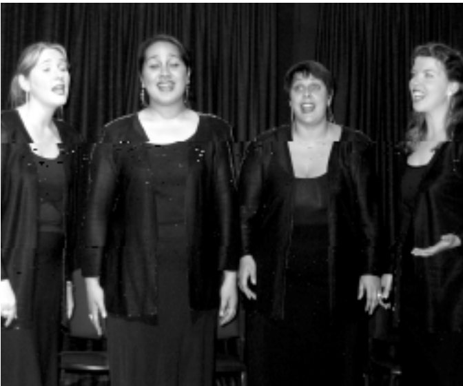
ABOVE: Barbershop quartet Eventime entertained guests.