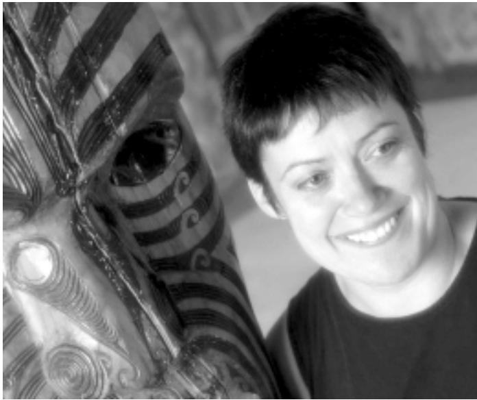
Dr Sue Crengle

The Action Plan for New Zealand Women sets out a commitment by government to improve women's participation in leadership and decision-making.