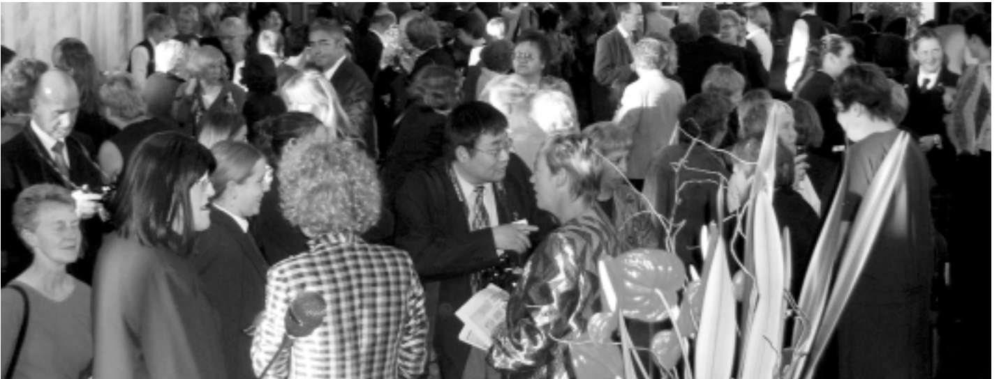
Over 300 guests from a wide range of organisations and groups attended the launch.